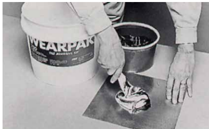
1. Remove Contents and mix in a one-to-one ratio