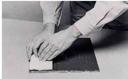
4. Affix tile to surface and press firmly in place